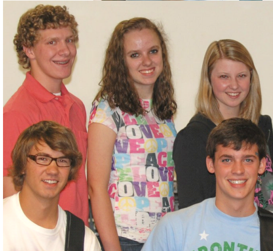
6 th -12 th